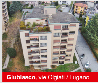
Giubiasco, via Olgiati / Lugano