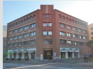
Mendrisio, via Franscini 10-12