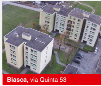
Biasca, via Quinta 53