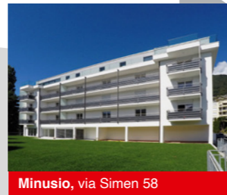
Minusio, via Simen 58