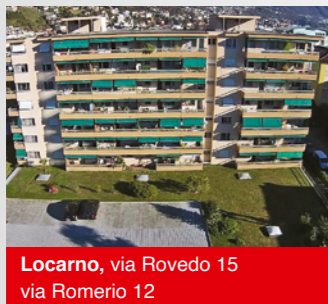
Locarno, via Rovedo 15 via Romerio 12