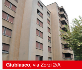
Giubiasco, via Zorzi 2/A