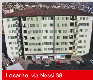
Locarno, via Nessi 38