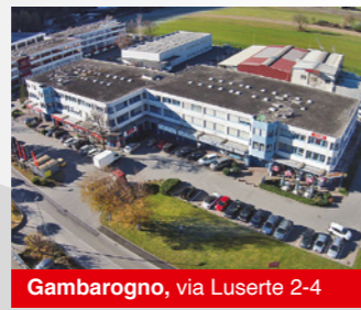
Gambarogno, via Luserte 2-4