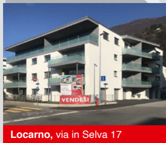
Locarno, via in Selva 17