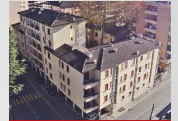
Lugano, via Beltramina 6-8-10