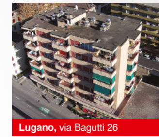
Lugano, via Bagutti 26