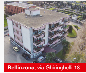
Bellinzona, via Ghiringhelli 18