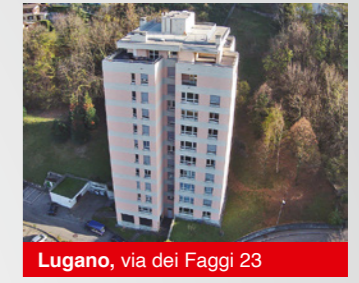
Lugano, via dei Faggi 23