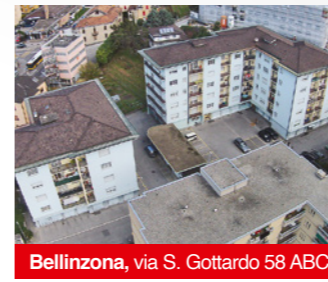
Bellinzona, via S. Gottardo 58 ABC