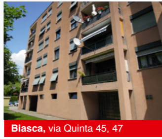
Biasca, via Quinta 45, 47