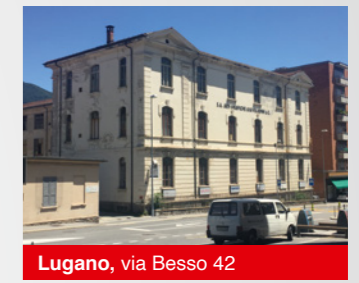
Lugano, via Besso 42