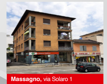
Massagno, via Solaro 1