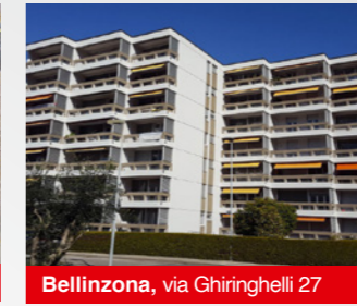
Bellinzona, via Ghiringhelli 27