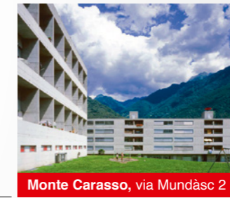
Monte Carasso, via Mundasc 2