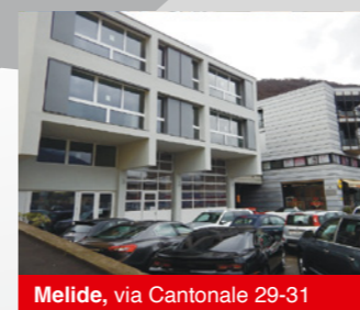
Melide, via Cantonale 29-31