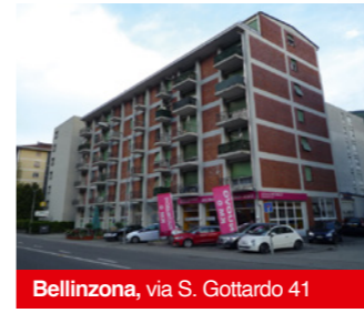
Bellinzona, via S. Gottardo 41