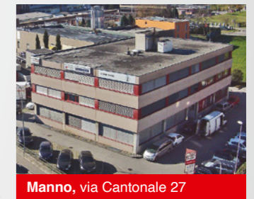
Manno, via Cantonale 27