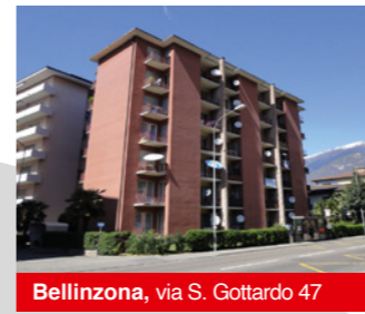
Bellinzona, via S. Gottardo 47