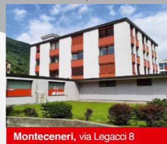
Monteceneri, via Legacci 8