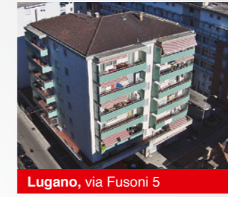
Lugano, via Fusoni 5